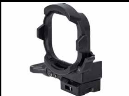
SD Front Mask for HERO9*

SD Front Mask for HERO8 SD Front Mask for HERO9