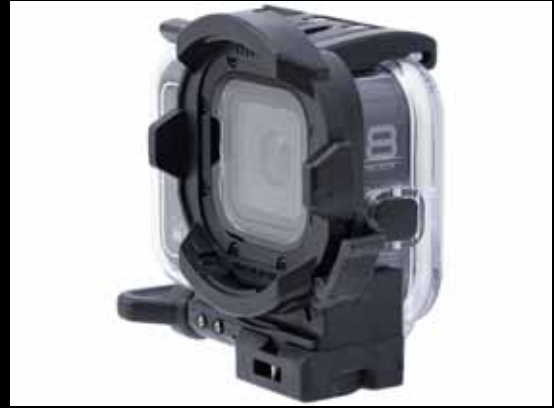
SD Front Mask for HERO8 installed on HERO8