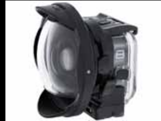
UFL-G140SD/UCL-G165SD on HERO8