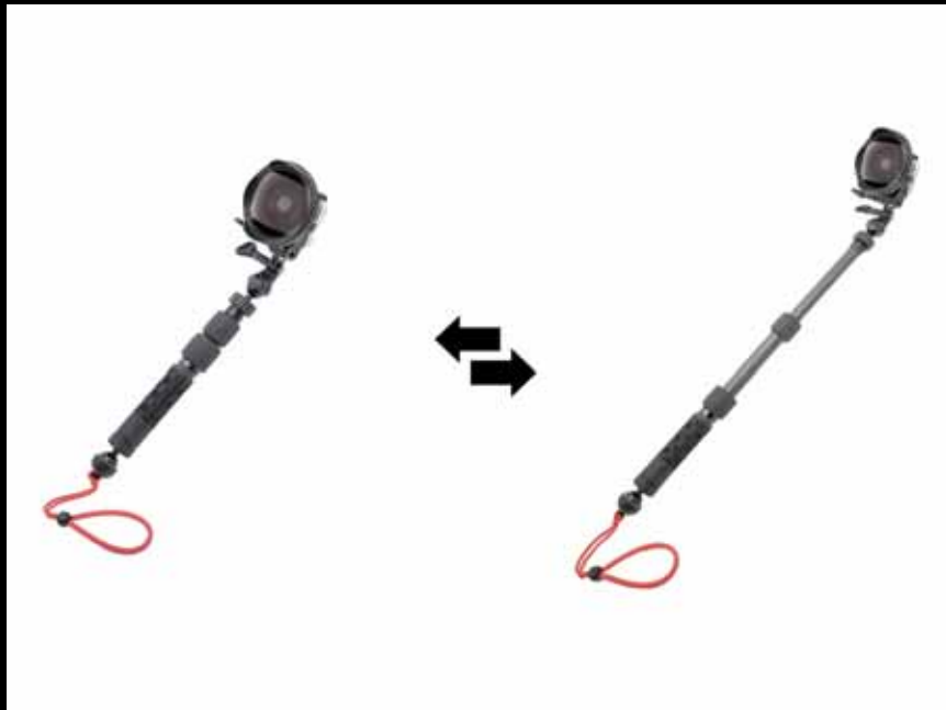
INON selfie kit using Carbon Telescopic Arm