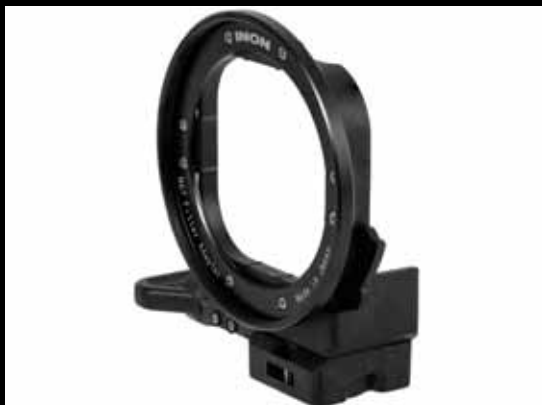
M67 Filter Adapter for HERO8

M67 Filter Adapter for HERO8 M67 Filter Adapter for HERO9