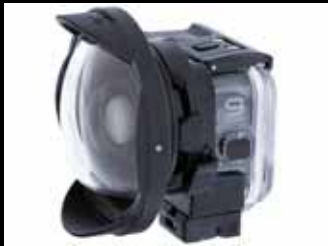
UFL-G140SD/UCL-G165SD on HERO9