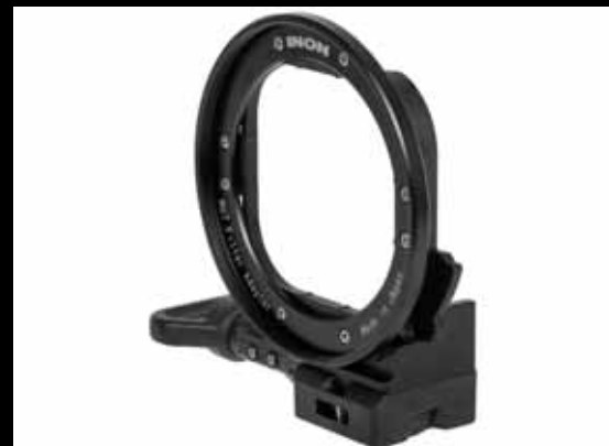
M67 Filter Adapter for HERO9