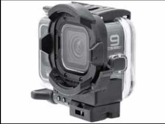
SD Front Mask for HERO9 installed on HERO9