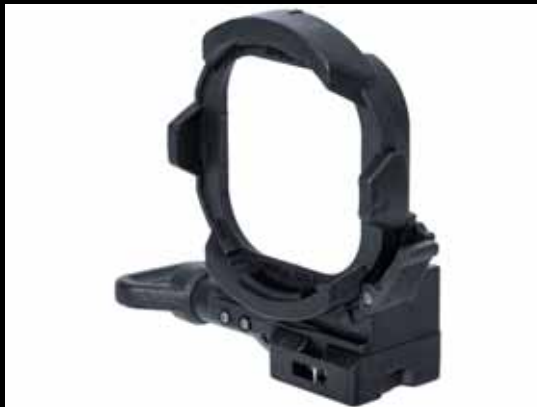
SD Front Mask for HERO8**

* For HERO9 Black Protective Housing + Waterproof Case only.