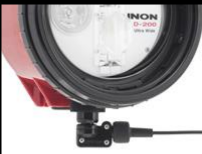
Optical cable connection

The D-200 is equipped with high performance slave sensor to trigger optically by optical triggering signal (i.e. camera's built-in flash).