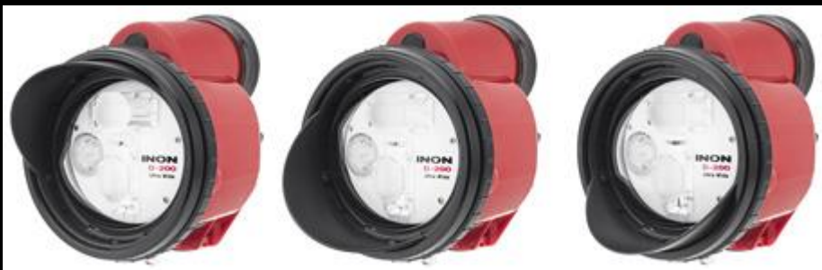
The shade goes to any position.