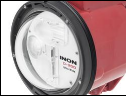
D-200 front dome lens

Furthermore, the D-200 has overcome drawback of high-power strobe which has long flash duration and reaches to FULL power in significantly short period of time after start flashing.