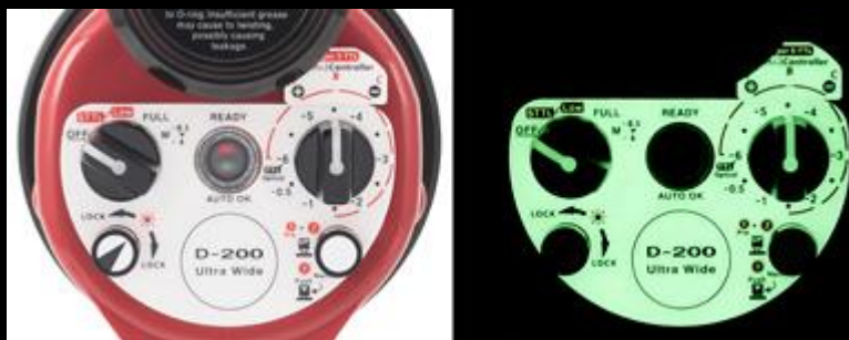
Left :Back panel (daytime)

Using white base high-intensity phosphorescence material for the back panel to improve visibility both during day and night dive.