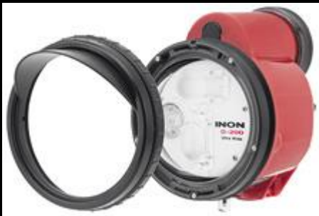
「Strobe Light Shade」 is removable.

The shade rotates 360 degree. Intuitive operation with light clicks offers comfortable adjustment even underwater.