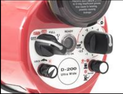
Large 「Main Mode Switch」 , 「EV Control Switch」

Also control dials are enlarged for user-friendly controllability even through thick gloves during cold water diving.